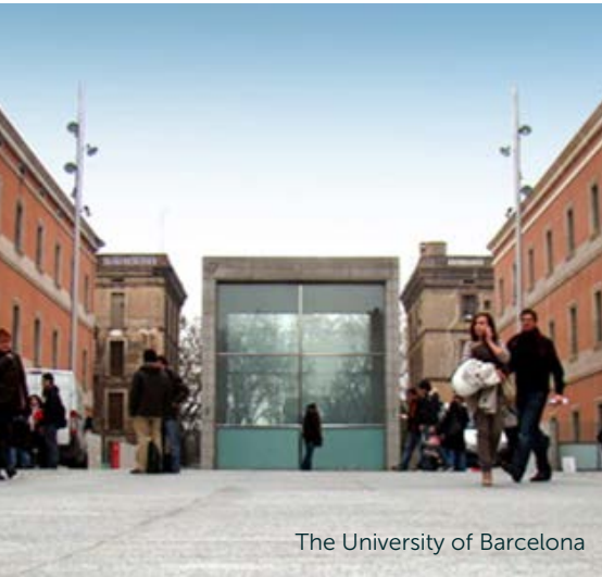
The University of Barcelona