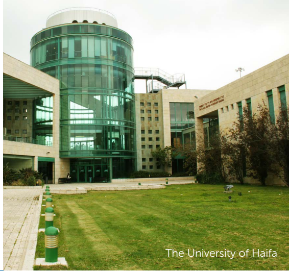
The University of Haifa