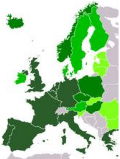
Are you in favor of the death penalty for a person convicted of murder?