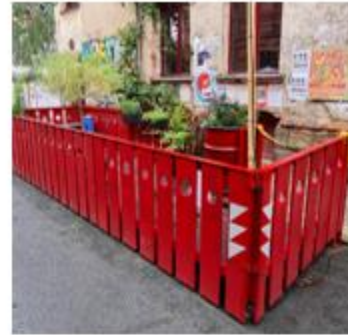
Parklets für den Leipziger Westen