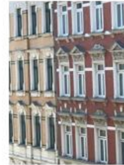
Tiny-Living im urbanen Raum