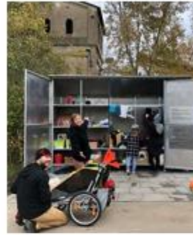
Tauschschranke im Leipziger Westen