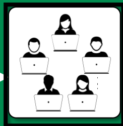
Step 2 Target group- oriented recruitment

There are different strategies for recruitment for each target group