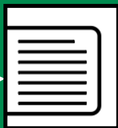
Step 1 An inviting vacancy text

An attractive vacancy invites candidates to come and introduce themselves.