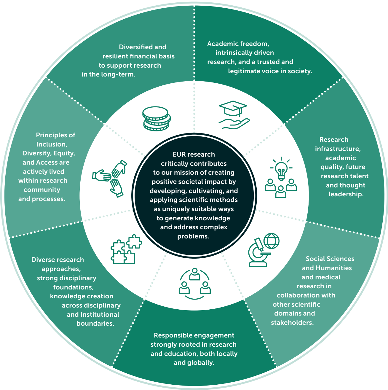
EUR Research Mission & Vision