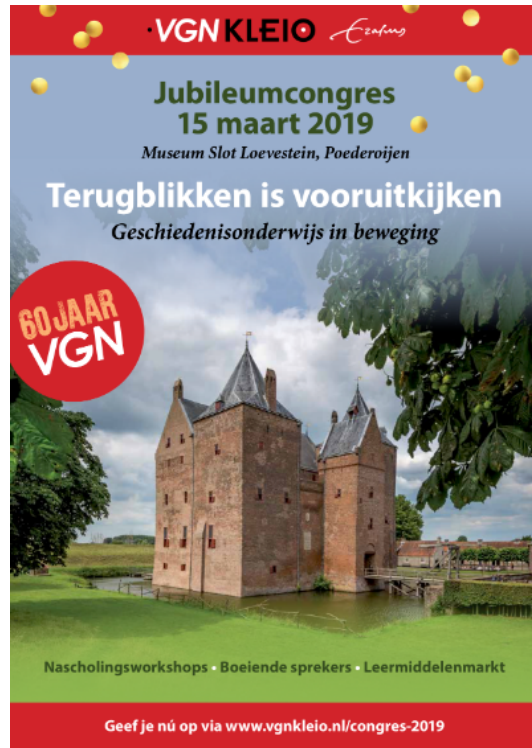
March 15: 5th National History Education Conference