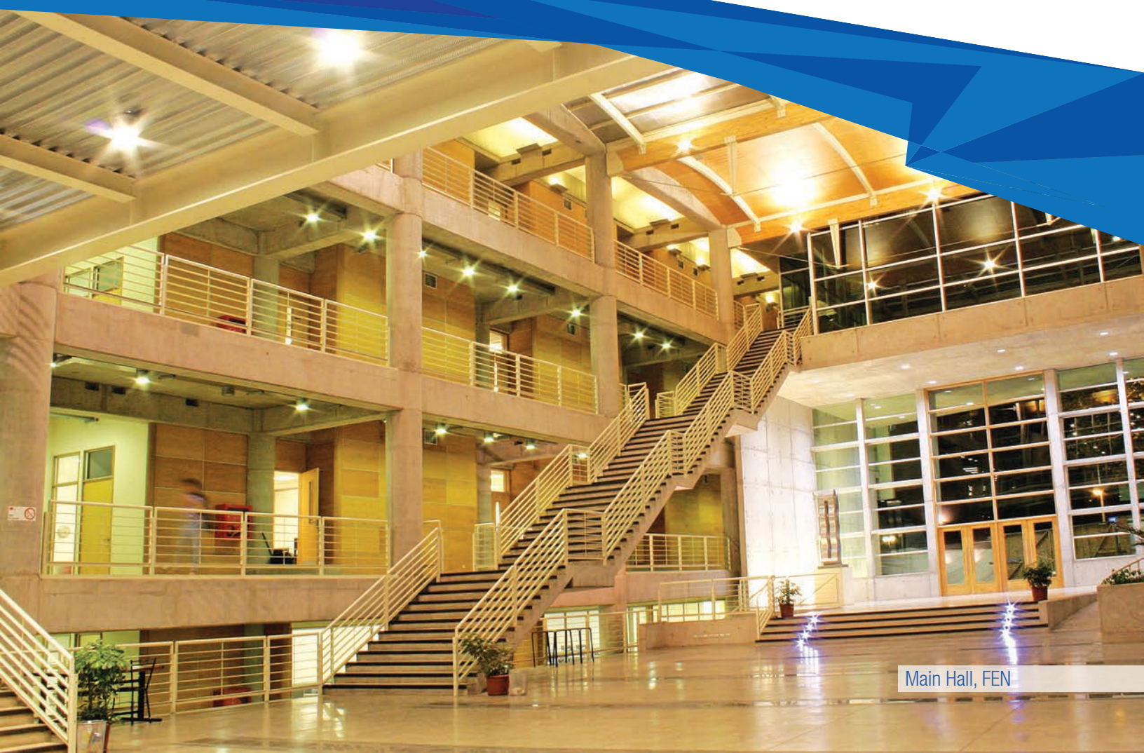
Main Hall, FEN