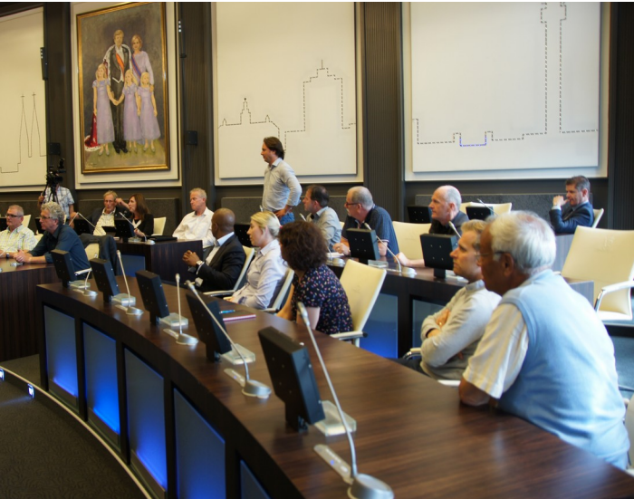
Roermond Peer Review, July 2016