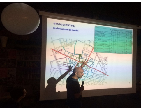
Reggio Emilia, meetings with retailers and residents