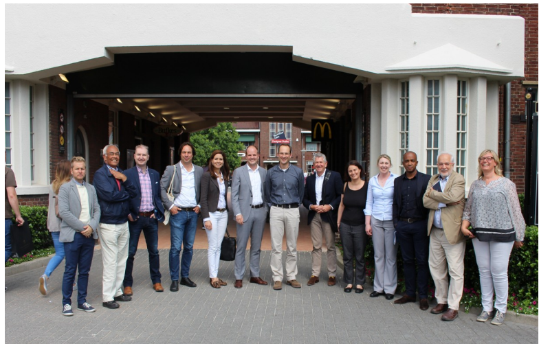
Experts from Portugal, Sweden, UK and the Netherlands at Roermond Peer Review

peer review each other's mobility plans, using the EC's SUMP Guidelines; identify good practices , for possible import; develop robust Regional Action Plans that will propose both new projects and improved governance devise, test and propose a Monitoring and Evaluation Tool for ex-ante and ex-post appraisal of policies and initiatives in the field of sustainable mobility and retailing.